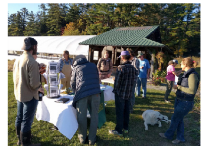
Participants review outreach materials at an on-farm workshop in Fairfax, VT