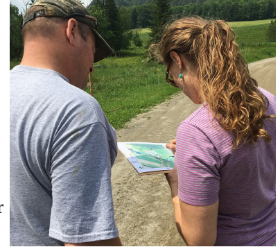
Technical assistance provided by the Orleans County Natural Resources Conservation District to a small farmer in the Lake Memphremagog watershed.

Funding for education, outreach and technical assistance has significantly increased with the Clean Water Fund since FY2016.