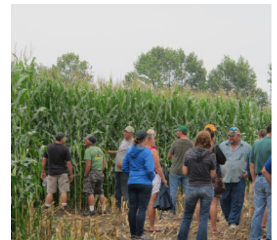
University of Vermont Extension Service hosts an on-farm educational event to discuss conservation practices and results with agricultural operators.