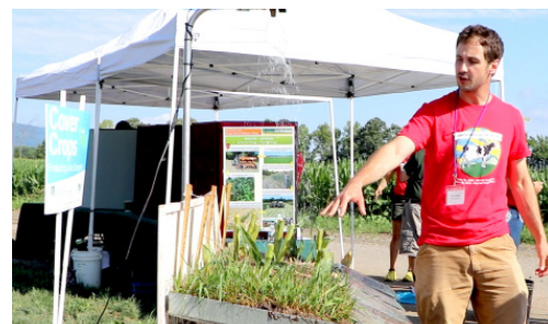
VAAFAM Engineer provides educational outreach to members of the general public at Breakfast on the Farm event in the Lake Champlain Basin during the summer of 2018.

*Program impact includes results from FY16-FY18.