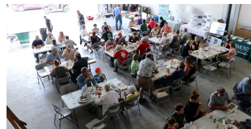
University of Vermont Extension Service and the Friends of Northern Lake Champlain hold a meeting in Franklin County to inform producers about regulatory requirements, best practices, and opportunities for technical and financial assistance.