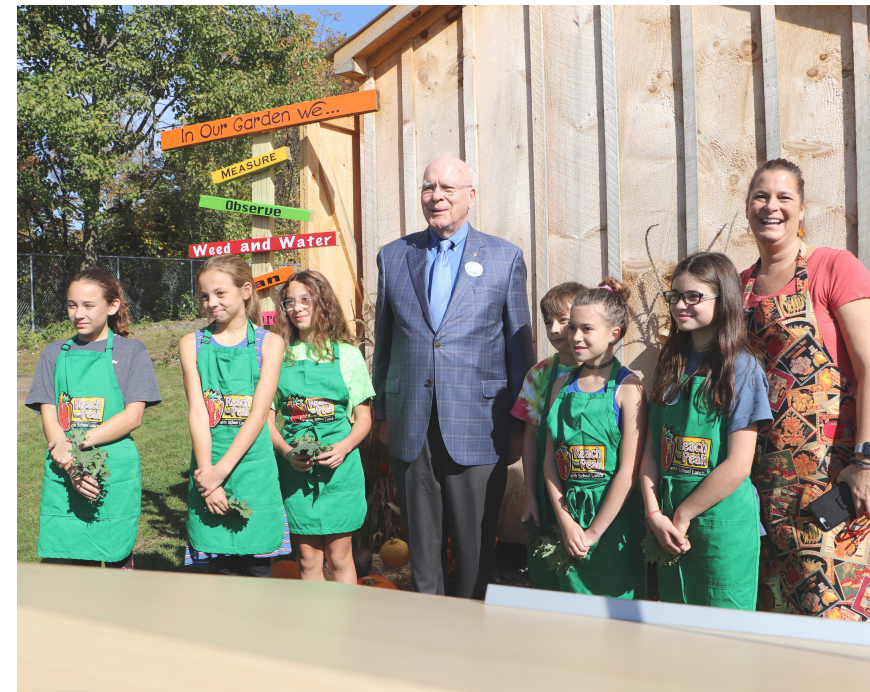
Senator Leahy visits St. Albans Town Education Center, a 2019 program grantee.